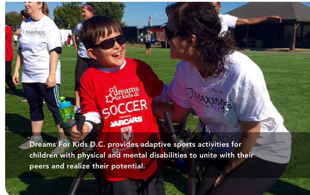
Dreams For Kids D.C. provides adaptive sports activities for children with physical and mental disabilities to unite with their peers and realize their potential.