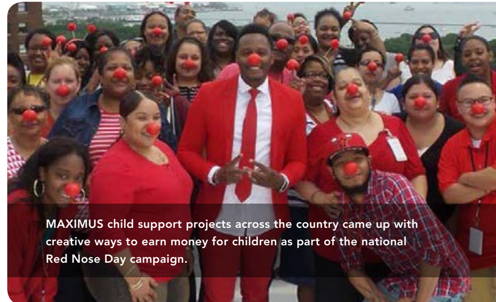
MAXIMUS child support projects across the country came up with creative ways to earn money for children as part of the national Red Nose Day campaign.

Participation in the Red Nose Day campaign is just one way the MAXIMUS child support practice is looking to harness the power of MAXIMUS employees to enrich the lives of children and families. ■