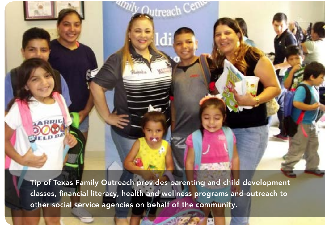
Tip of Texas Family Outreach provides parenting and child development classes, financial literacy, health and wellness programs and outreach to other social service agencies on behalf of the community.

MAXIMUS Foundation grantee, Tip of Texas Family Outreach, is located in the heart of downtown Brownsville, Texas. It provides parenting and child development classes, financial literacy, health