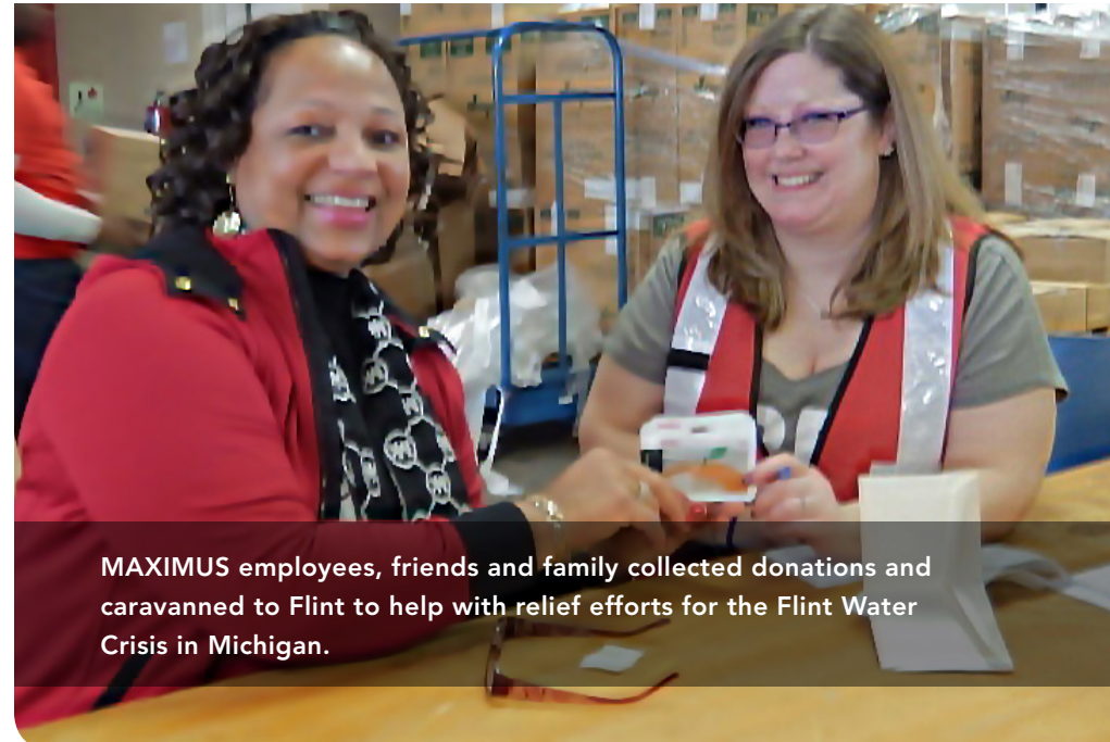
MAXIMUS employees, friends and family collected donations and caravanned to Flint to help with relief efforts for the Flint Water Crisis in Michigan.